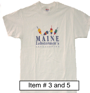
Item # 3 and 5