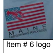
Item # 6 logo